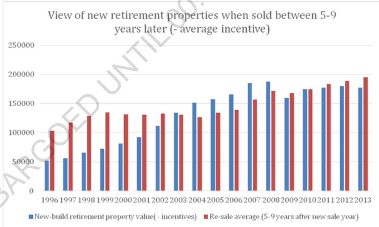
Figure 1: Value of new retirement properties when sold between 5-9 years later

Figure 1 shows the average resale value, by year, when average incentive figures were removed from the first sale price: